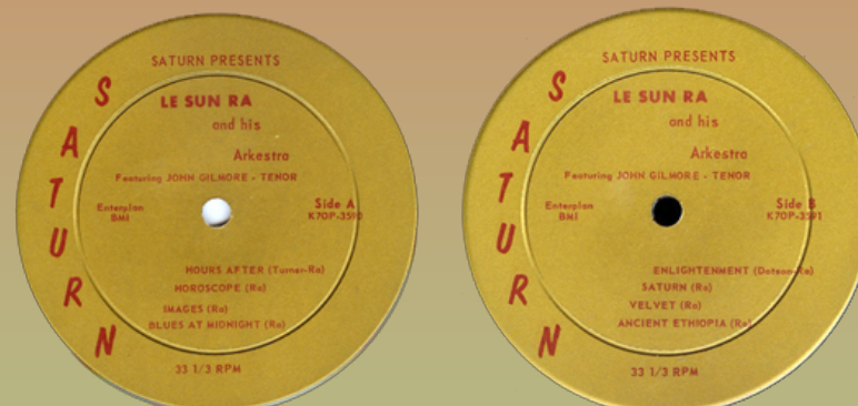
Sides A and B were reversed in the original LP label printing.

On Jazz in Silhouette , Sun Ra and the band radiate the period’s Chicago jazz sound, with lilting melodies, intertwining chords, and surprising dynamic shifts. Sunny’s compositions demonstrate his ability to write memorable songs in the jazz tradition.